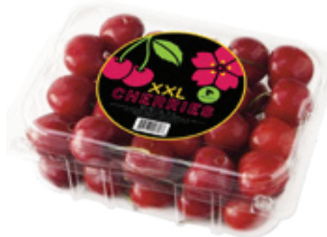
1 lb. CLAMSHELL

Educates consumers on large cherry point of difference.